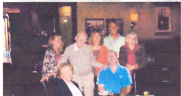
The pre museum lunch group.